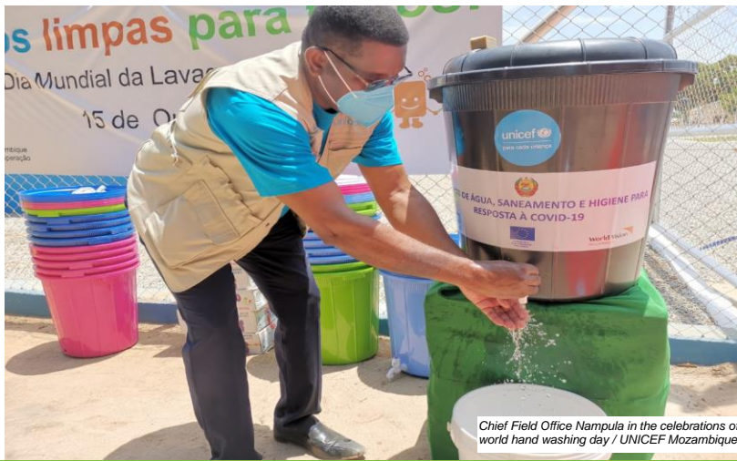
Chief Field Office Nampula in the celebrations of world hand washing day

Reporting Period: 26 September- 23 October 2020